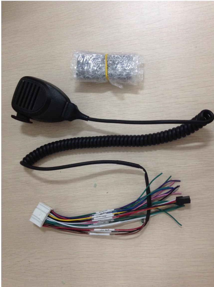
4 Pin analog intercom